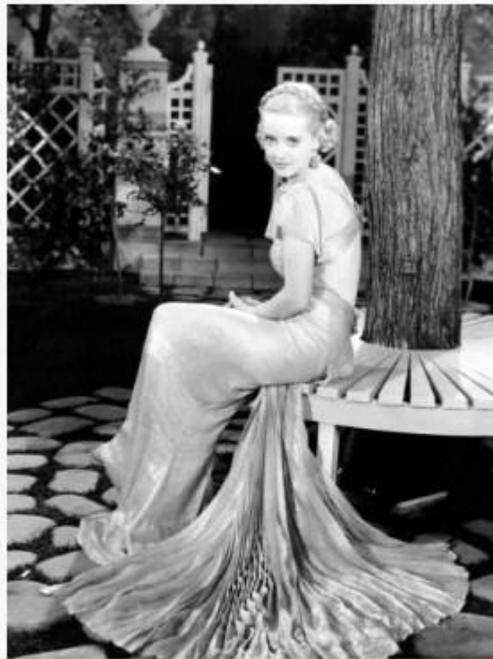
Fashions of 1934 with Bette Davis

1934, directed by William Dieterle. With William Powell, Bette Davis.