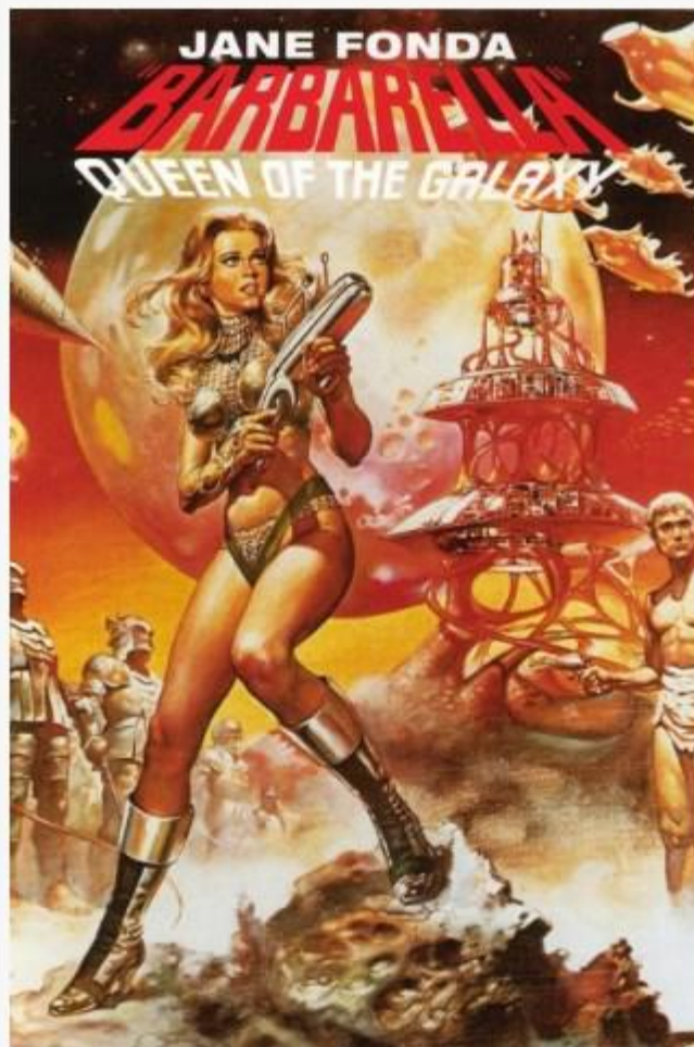
Barbarella with Jane Fonda

1968, directed by Roger Vadim. Produced by Dino De Laurentiis. Screenplay by Terry Southern. With Jane Fonda, John Phillip Law, Anita Pallenberg.