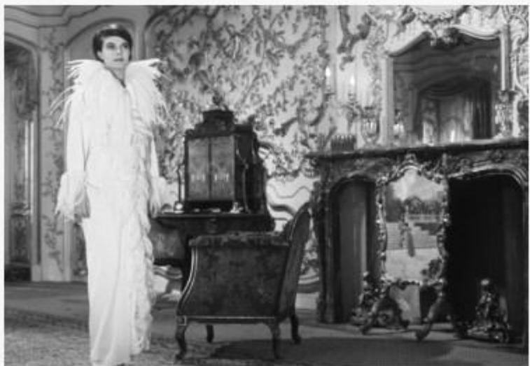
Last Year at Marienbad

1961, directed by Alain Resnais. Written by Alain Robbe-Grillet. Cinematography by Sacha Vierny. With Delphine Seyrig, Giorgio Albertazzi, Sacha Pitoëff.