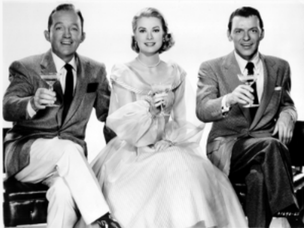
High Society with Grace Kelly, Frank Sinatra, Bing Crosby

1956, directed by Charles Walters. With Frank Sinatra, Bing Crosby, Louis Armstrong, Grace Kelly.